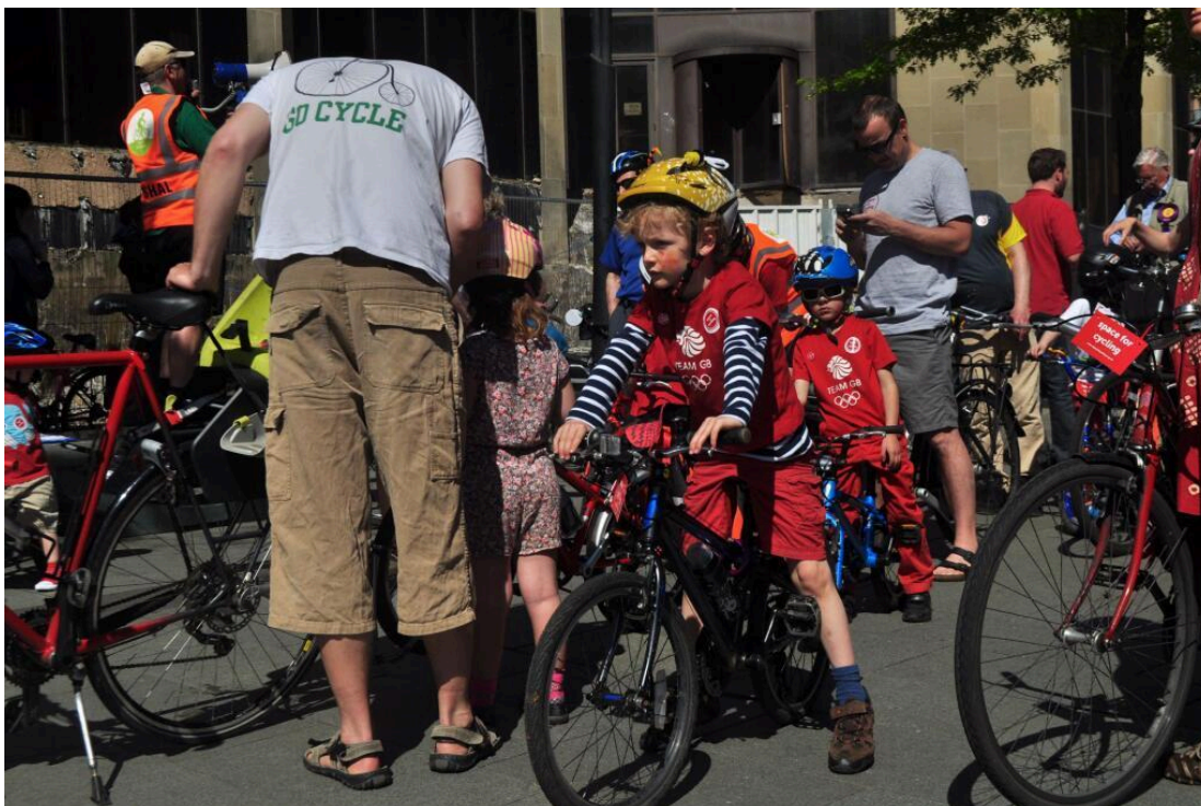
The small riders are ready to go!