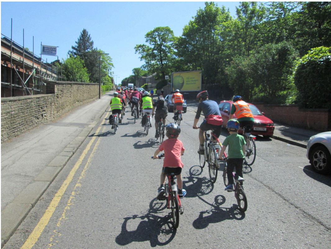
Fun with the family: what if we could do this every day?