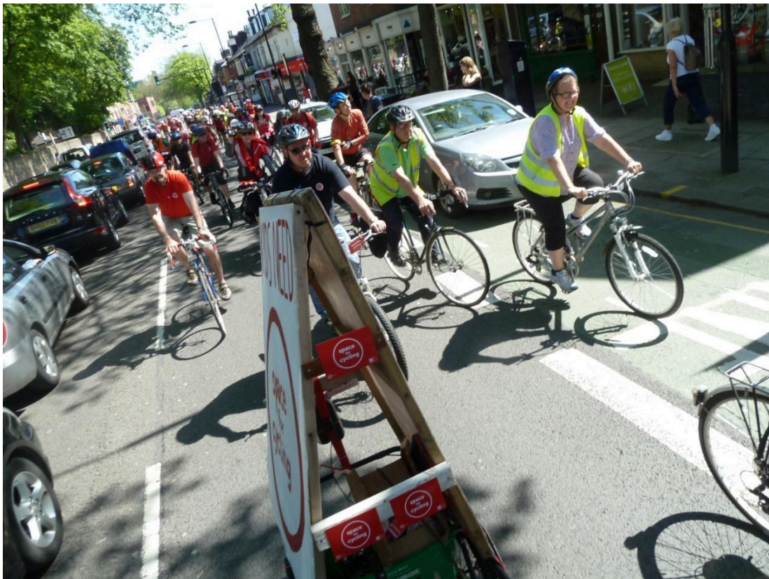
Taking Ecclesall Road by storm!

Photos from last year's Big Ride (download hi res versions at https://www.dropbox.com/sh/7u6ftuy9nbsjoby/AAA28tDDc9O6MKec6zdD8XF1a?dl=0 )