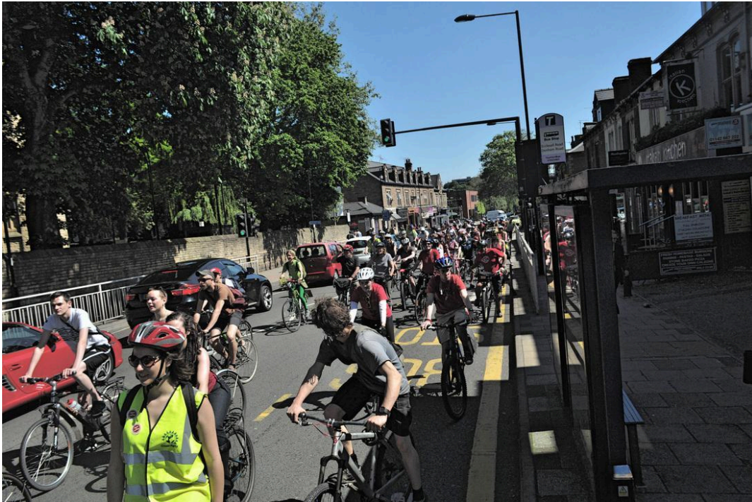
Bikes as far as the eye can see!